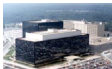
Intel, Cyber & Security